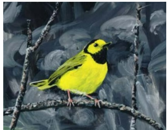
Hooded Warbler painting by Lynn Barber (Wausau, WI) featured on convention t-shirts

Special thanks are due to all the volunteers and leaders from the WSO and Goss Bird Club without whom this event would not have been possible. We hope to see you May 2024 in Two Rivers!